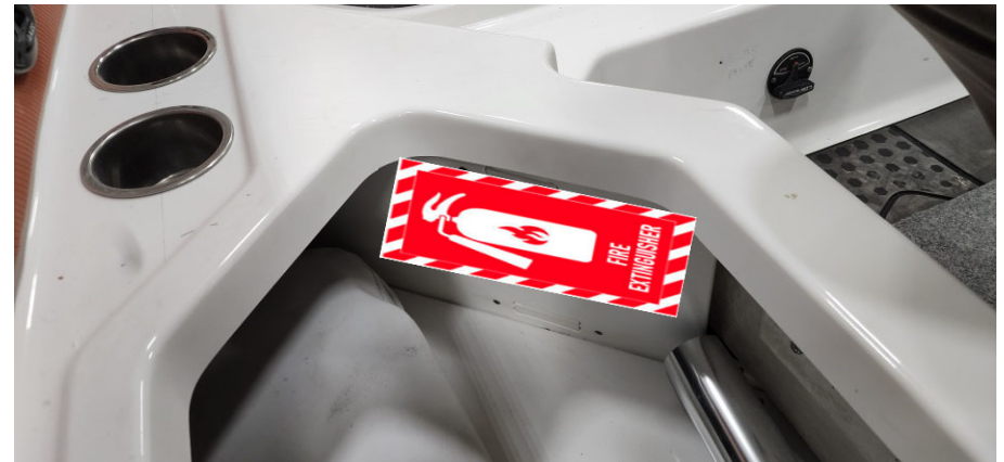
Type: Clean Agent (FK-5-1-12) Size: 5B:C