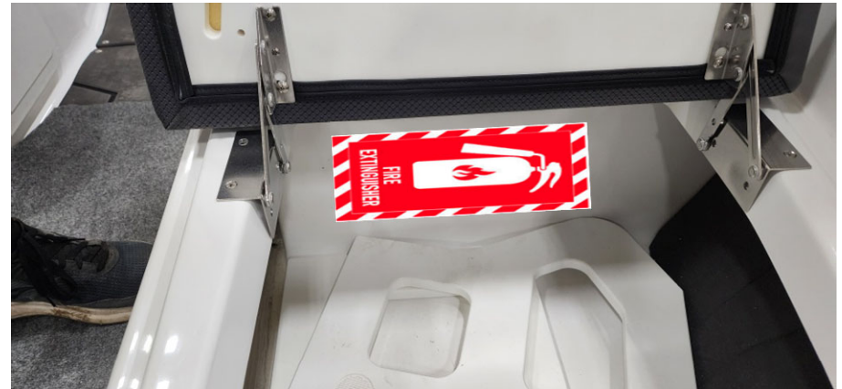
Type: Dry Chemical Size: 1A:10B:C